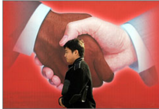
Enlarge

Updated 11/5/2006 1:40 PM ET E-mail | Save | Print | Reprints & Permissions | Subscribe to stories like this RSS