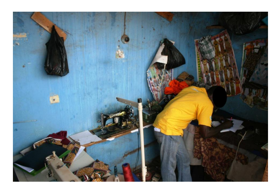
A tailor who owns rents space in a concrete building.