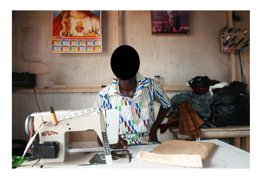
A seamstress who owns a converted shipping container