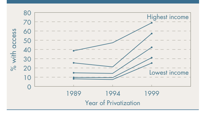
Figure 2: Bolivia: Household Access to Telephone Services, 1989–99