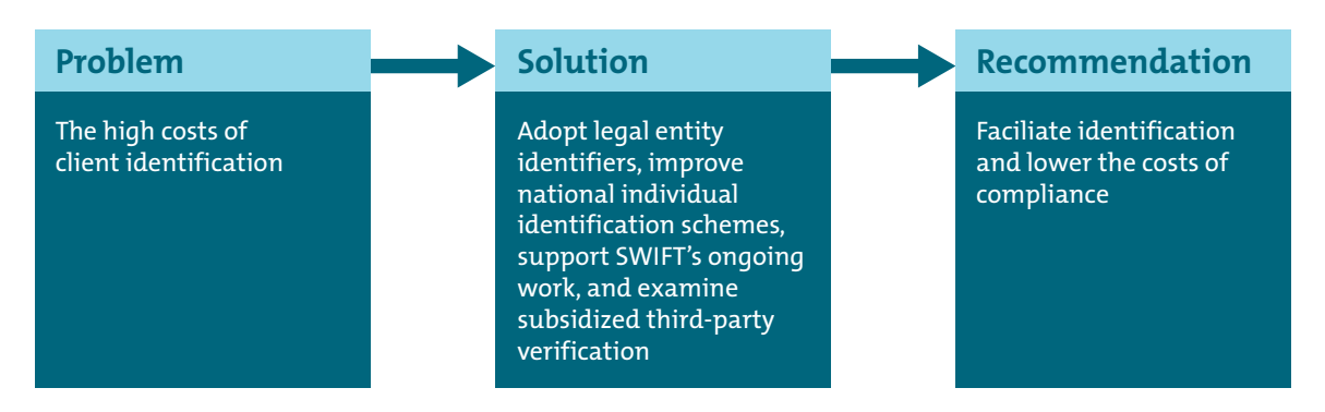
Figure 5. Recommendation 5: Problem Identification and Solution Formulation

The 2015 CGD report recognized client identification challenges as a major driver of anti-money laundering and countering the financing of terrorism (AML/CFT) compliance costs. It backed a series of technical initiatives to improve the identification of natural persons and legal entities in customer onboarding and payments facilitation.