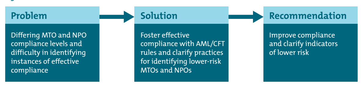
Figure 4. Recommendation 4: Problem Identification and Solution Formulation

The 2015 CGD report recognized that money transfer operator (MTO) and nonprofit organization (NPO) anti-money laundering and countering the financing of terrorism (AML/CFT) compliance was uneven, and that some organizations in these sectors needed to improve their compliance practices. At the same time, the report drew attention to the fact that regulators did not always treat MTOs and NPOs in a manner that was proportionate with their risk profiles.