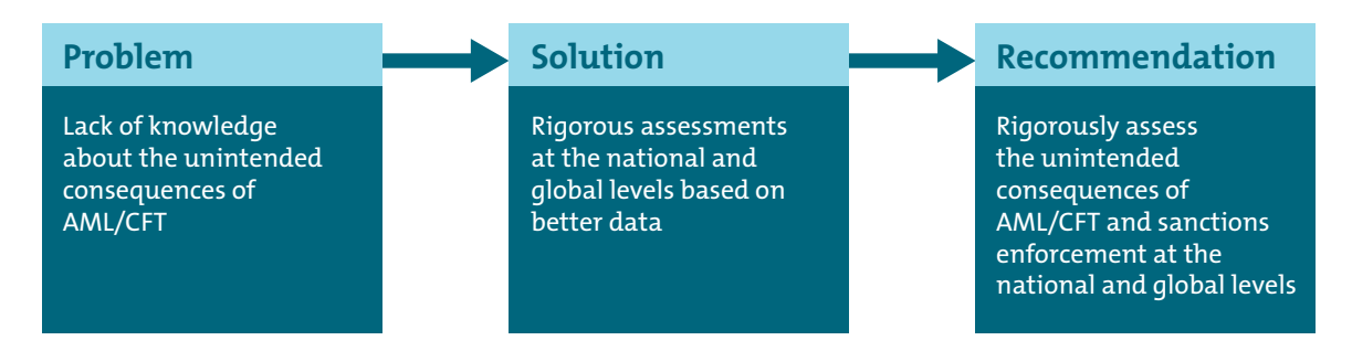
Figure 1. Recommendation 1: Problem Identification and Solution Formulation in the 2015 Report

The 2015 report also recommended that FATF revise its mutual evaluation methodology to better capture the unintended consequences of AML/CFT regulations. This methodology is designed to guide peer reviews in which FATF members assess each others' AML/CFT systems for alignment with the FATF Recommendations, in terms of both technical compliance and practical effectiveness. The 2015 report suggested that the methodology should emphasize a "whole economy" view and that it assess whether jurisdictions' AML/CFT regulations are inadvertently displacing legitimate financial activity into the informal sector, where it is harder to track. It also recommended that peer reviews look to whether local firms were engaging in regulatory overcompliance.