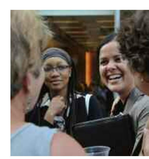
2008 Sabot Memorial Lecture attendees chat during the reception.