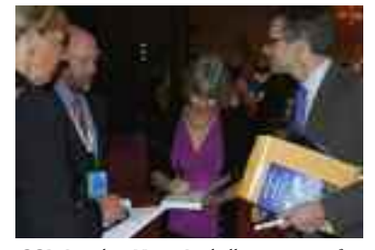
CGD President Nancy Birdsall signs a copy of The White House and the World at the Republican National Convention in Minneapolis–St. Paul.