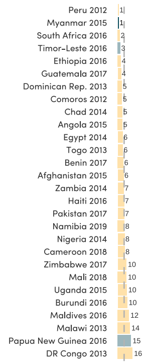
DHS 2015 (+/-) 3 years