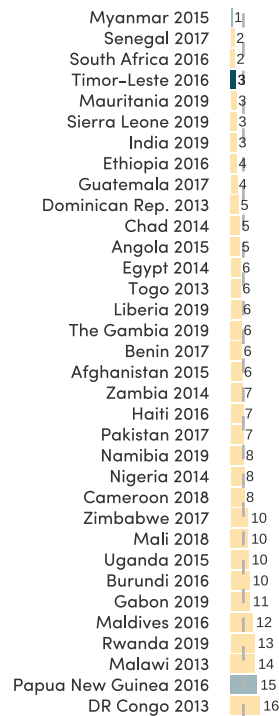
DHS 2016 (+/-) 3 years