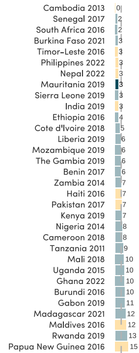
DHS 2019 (+/-) 3 years