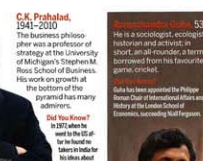
C.K. Prahalad, 1941-2010 The business philosopher was a professor of strategy at the University of Michigan's Stephen M. Ross School of Business. His work on growth at the bottom of the pyramid has inspired many. Did You Know? He is the author of The Fortune at the Bottom of the Pyramid , a book that has become a bestseller in the US.