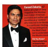
Fareed Zakaria, 47 Author of The Post-American World , The American Mind , and The Lexus and the Olive Tree . He is a leading voice on globalisation and the future of the West. Did You Know? He is the author of The American Mind , a book that has become a bestseller in the US.