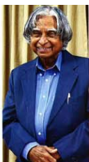
APJ Abdul Kalam, 80 His work on India's nuclear programme has helped cement its place as a potential superpower. But his efforts to ignite young minds are equally inspirational. Did You Know? During the Pokhran II 1998, Kalam was given the nickname Mujib General Pitting.

Activists, academics, scientists, writers. Even a former president of the country. People from India and the diaspora who have influenced people across the globe with the power of their ideas.