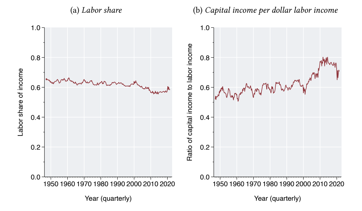
Figure 1: RELATIVE FACTOR INCOMES: United States nonfarm business sector, 1947Q1-2021Q3